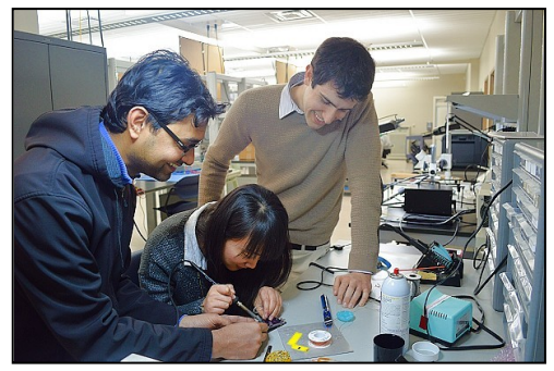
Power electronics lab

CURENT research is a systems-level approach to addressing the challenges of integrating renewables into the extremely large and complex power grid. This problem requires a multidisciplinary Center approach in order to: (1) have a sufficiently large and diverse team of researchers to address the various research challenges; (2) interact closely with industry to understand practical systems issues; and (3) create the innovation culture needed to transform the large legacy system.