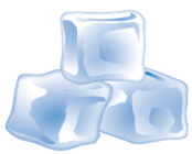
1. Excessive ice formation

Recent consensus documents including NSF-funded roadmaps highlight that fundamental barriers to bio-preservation are essentially the same for all living systems. Our research and engineering will be aimed at eliminating or controlling ice, toxicity from cryoprotective agents (CPAs), and thermal and mechanical stress—the causes of nearly all biological damage at subzero temperatures (Figure 2).