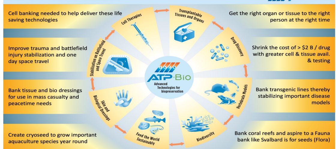
Fig. 1. ATP-Bio Research Milestones