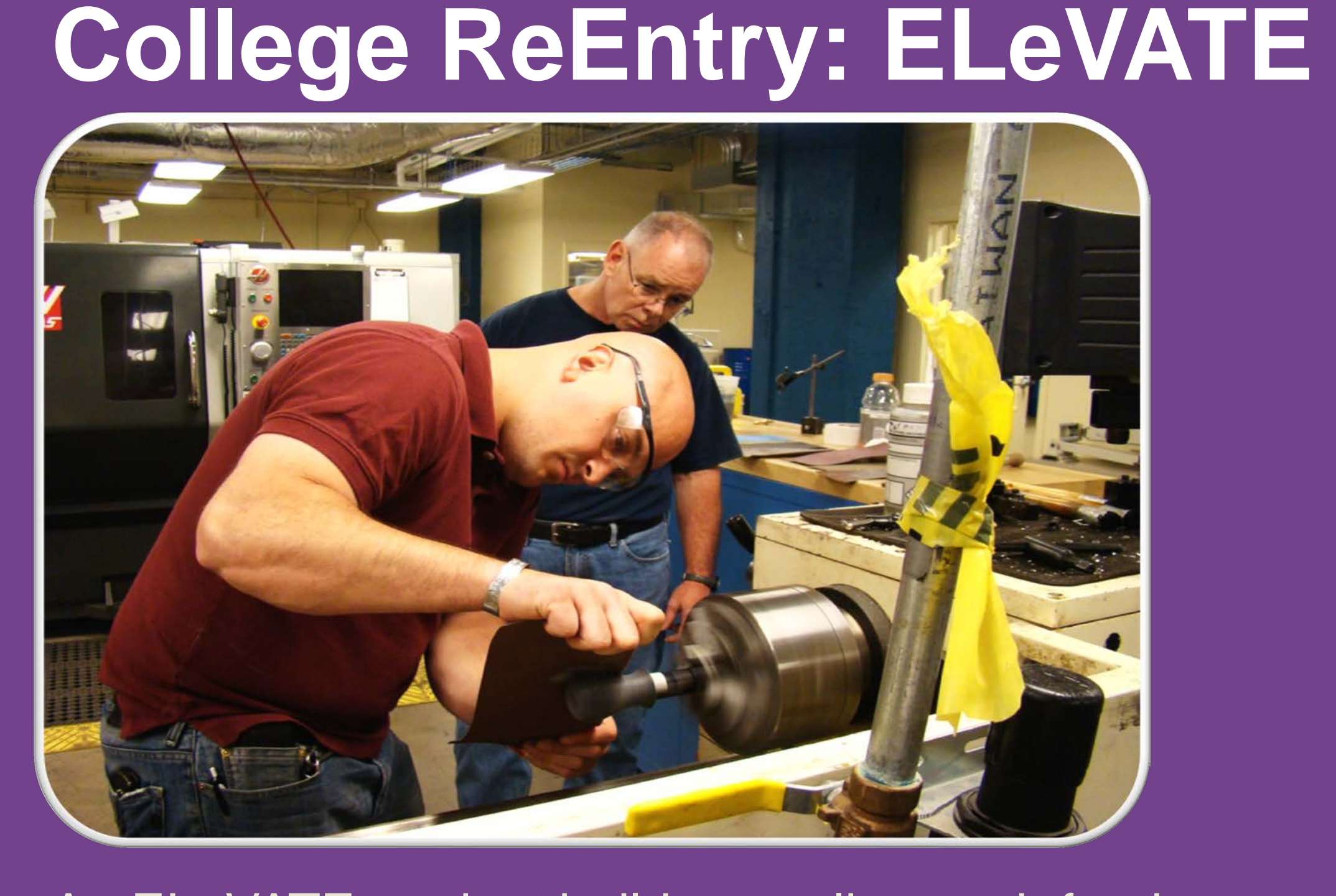
An ELeVATE student builds a replica torch for the National Veterans Wheelchair Games during Machining Skills Workshop. The workshop is one of the many activities that allow veterans to learn skills necessary for successful transition to STEM fields.