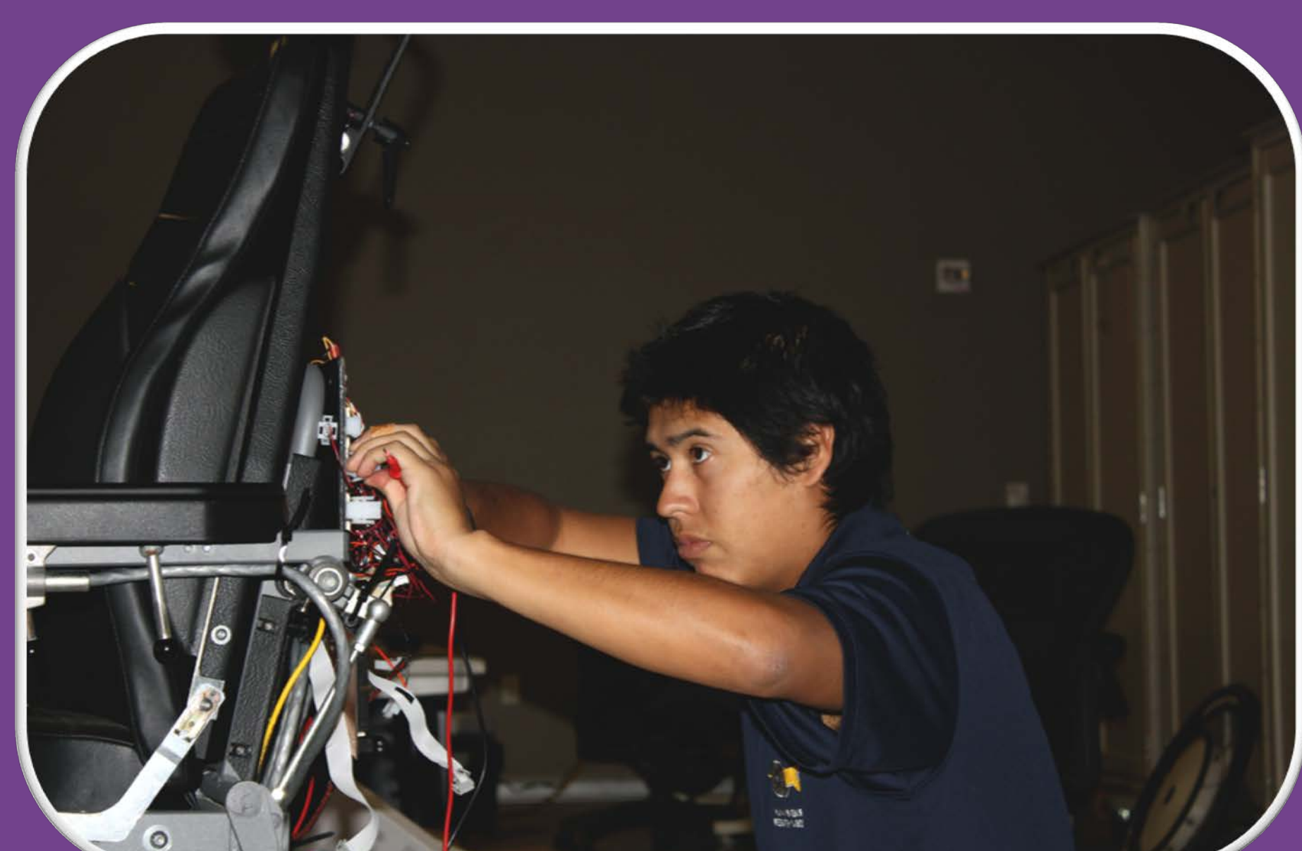
QoLT graduate students are prepared to to apply their understanding of human functions and behaviors in everyday living to the design of intelligent systems that work in symbiosis with a person in need.