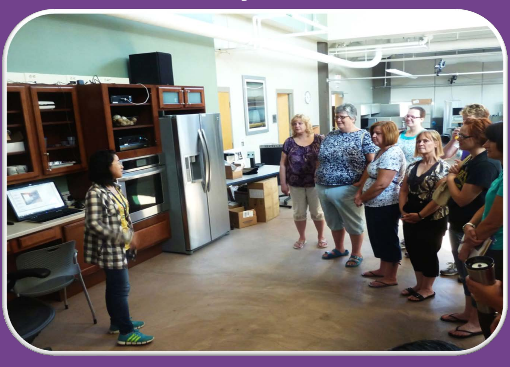
QoLT student introduces visiting teachers to the Cueing Kitchen. Regular open house events and tours increase public awareness of QoLT research.