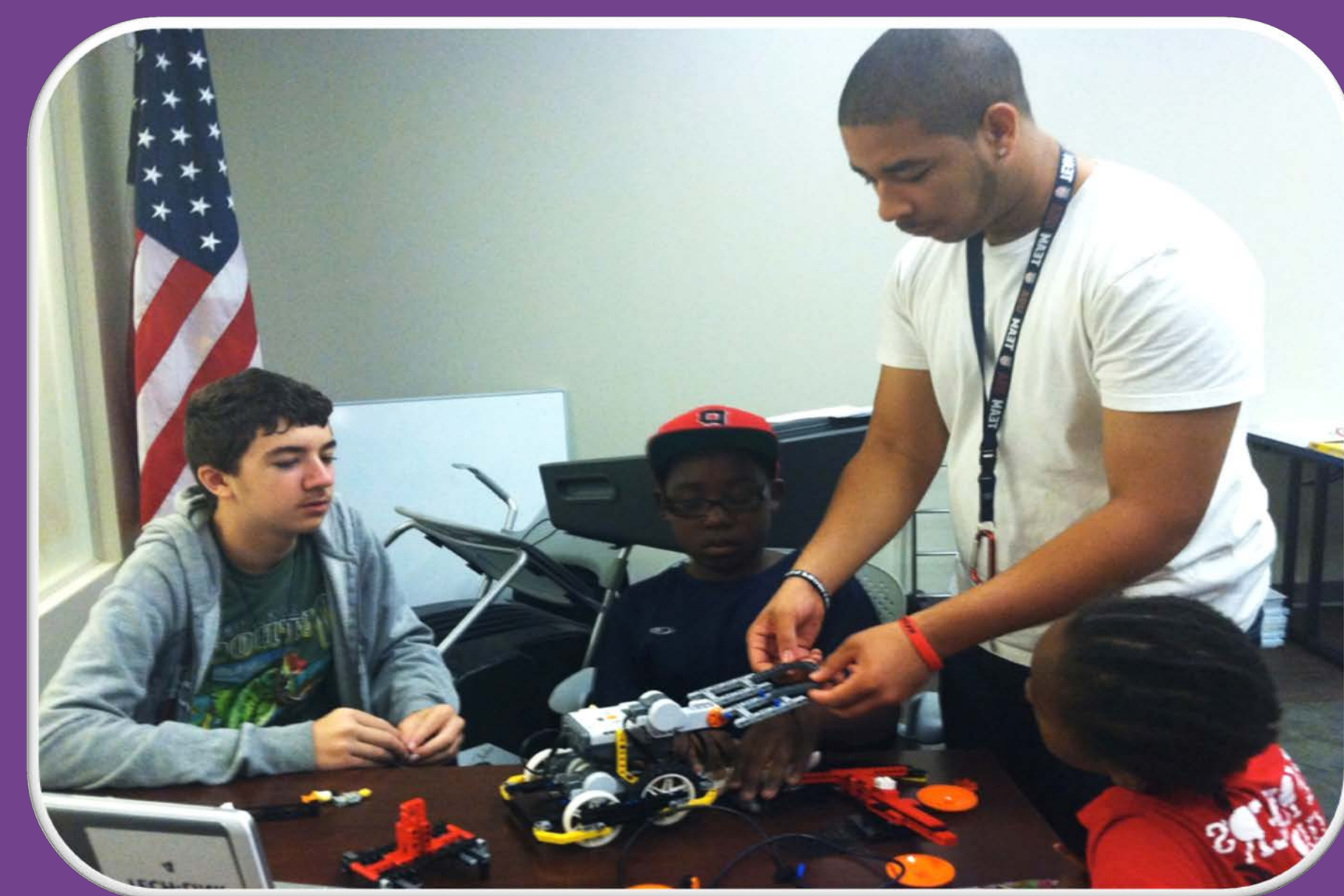
A high school intern helps middle school TechLink program participants build their first Lego robot.