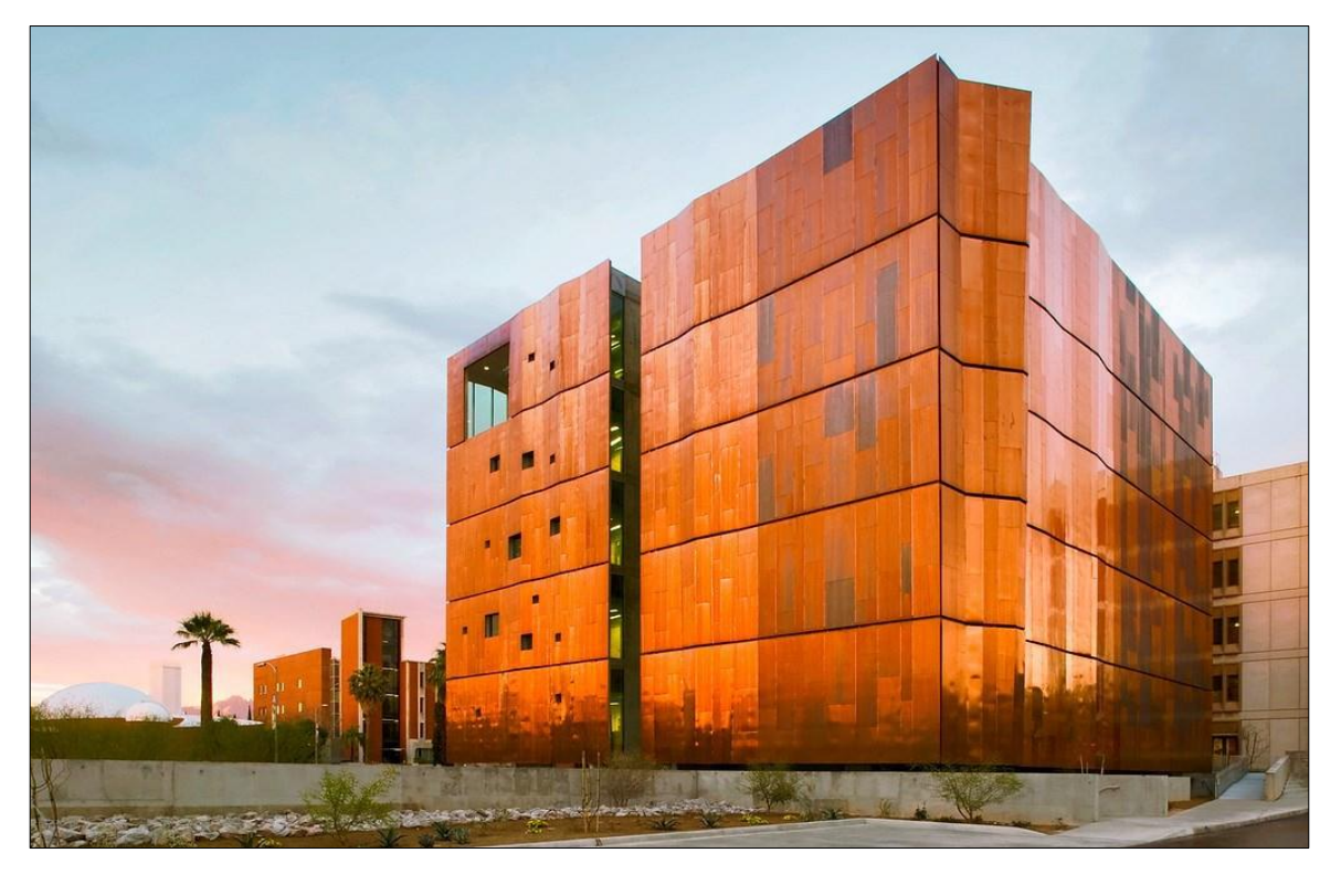
CQN is headquartered at the Meinel building in the Wyant College of Optical Sciences at the University of Arizona