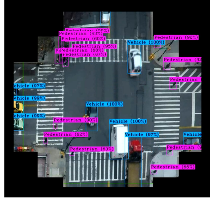
Smart City Intersection. Vehicle and pedestrian object detection at COSMOS pilot site located at the corner of 120th street and Amsterdam Avenue, New York City.

CS3's diversity and culture of inclusion (DCI) objectives are to (1) create and maintain an organizational culture in which individuals representing diverse experiences, backgrounds, and communities have the opportunity to contribute their full potential to accomplish CS3's mission, and (2) ensure CS3 programs adhere to its guiding principles of developing technology to serve the public good, using community engagement for direct use-inspiration, and addressing the "digital divide."