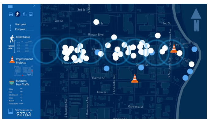
West Palm Beach Mobility Intelligence Testbed smart streetscape technologies.