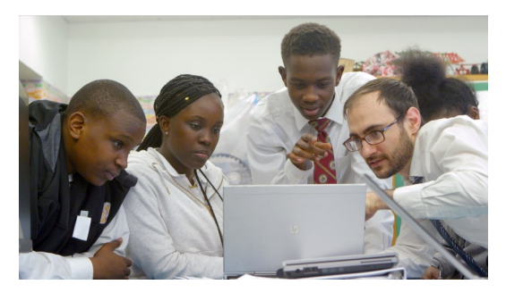
COSMOS educational platform and accompanying toolkit for K-12 students to learn STEM subjects including experiments related to wireless networks. Frederick Douglas Academy I, Harlem, NY.

CS3's engineering process will begin with the study of community-specific application requirements, constraints, and sensitivities. The resulting community-inspired applications will be piloted within three distinct urban testbeds-in New York City (NY), West Palm Beach (FL), and New Brunswick (NJ)leveraging prior federal and municipal investments. Outcomes from these pilots will catalyze a novel innovation ecosystem, drawing upon CS3's broad network of aspiring entrepreneurs, emerging start-ups, and established companies. Realizing and sustaining this vision requires a next-generation workforce that cross-cuts engineering, data science, social science, and policy. CS3 will leverage shared, day-to-day streetscape experiences to attract students from diverse disciplines and backgrounds to engage in the emerging discipline of smart cities. Built on the four closely integrated foundational elements of NSF's ERC program-Research, Engineering Workforce Development, Diversity