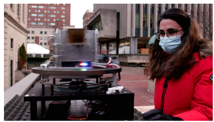
Columbia Engineering students take millimeter wave channel measurements for the COSMOS advanced wireless research testbed in West Harlem. COSMOS is a cloud-enhanced open software defined mobile wireless testbed for city-scale deployment.

The ERC does this by employing five main strategies. The first strategy is convergent curriculum development,